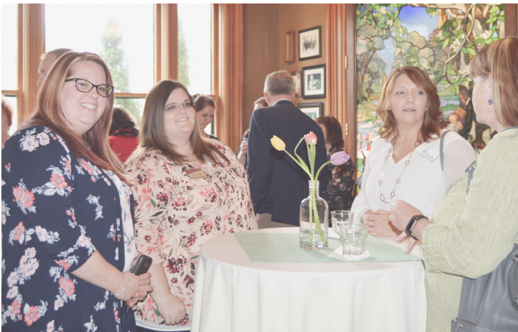
Socializing at the Administrator Graduation Luncheon