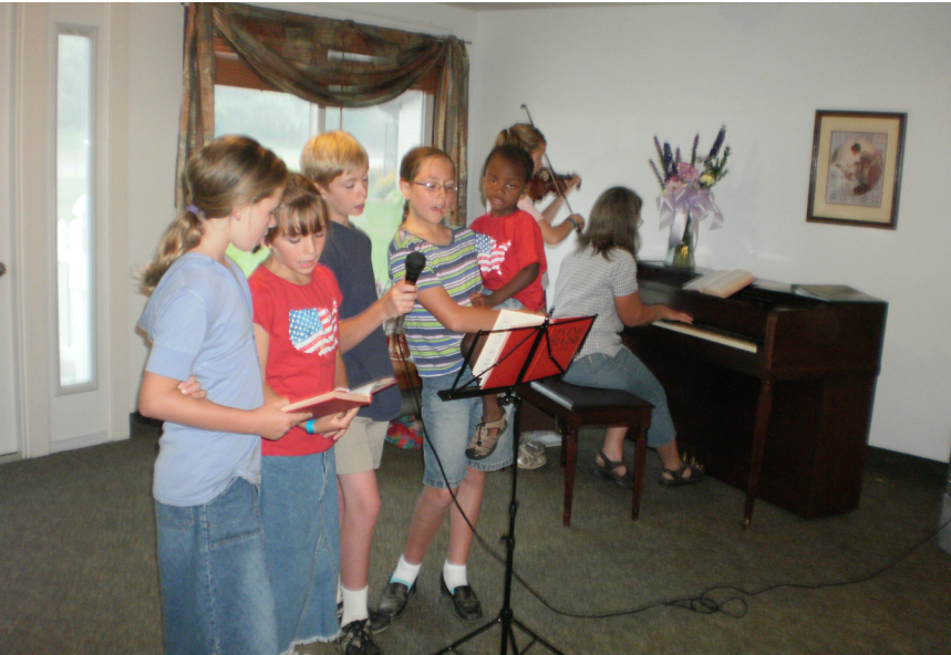
Volunteers taking part in music ministry at FountainView in Coopersville.

In 2010, 113 volunteers provided almost 2500 hours of their time to Baruch facilities.