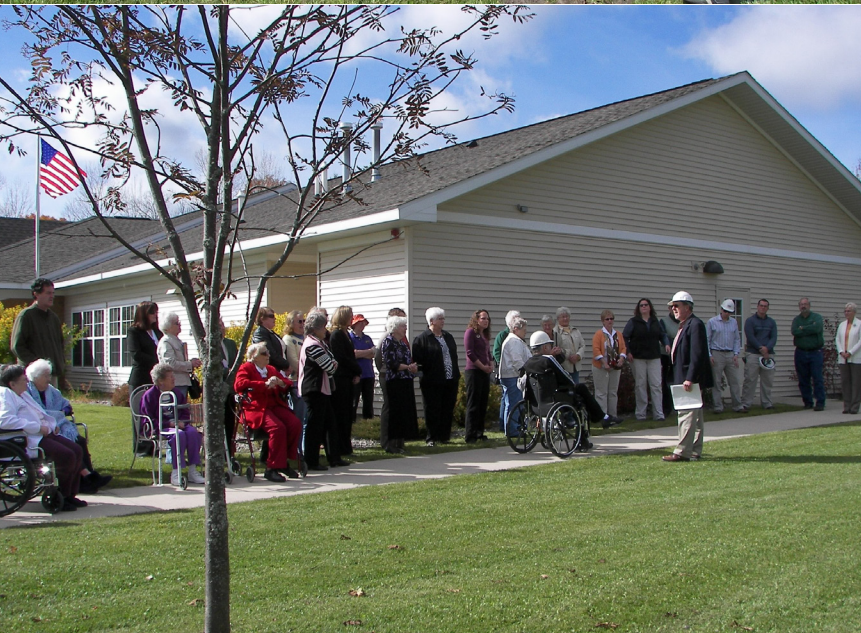
Breaking ground on the new Cedar Cove addition.